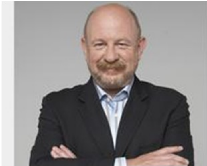
A view of the celebrity auctioneer