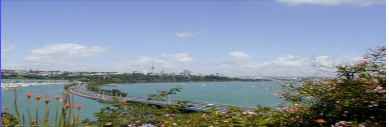
A view from the deck

Tickets available from Sean: numbers now limited